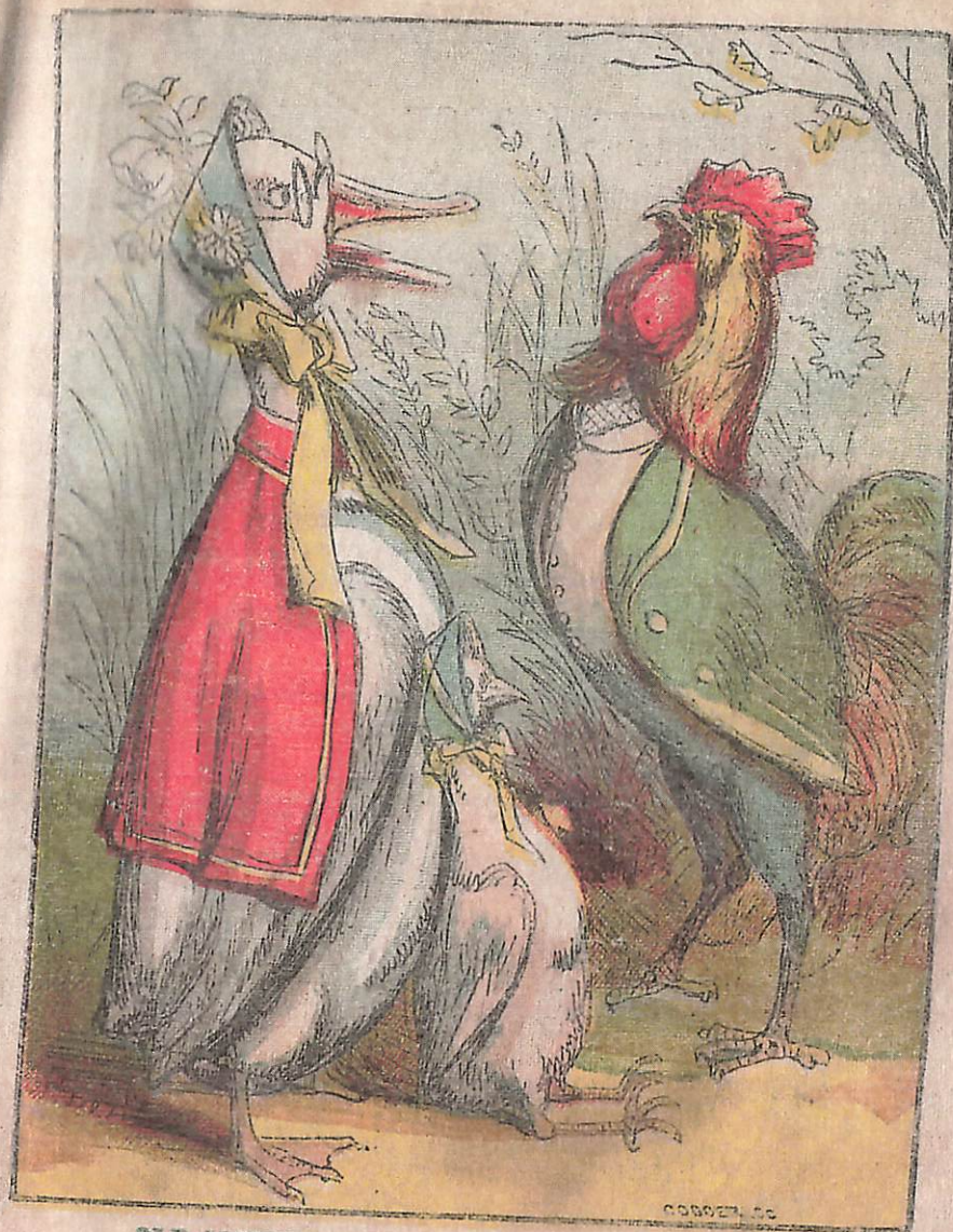
OLD MOTHER GOOSE ABUSES MR. COXSOMB.

To his guests Gobble said, "What the farmer just spoke Was nothing at all, 'Twas only uttered in joke!" Then some went to the water, Having expressed a strong wish To finish their dinner With some choice sort of fish. Mr. Bantam was there, And, as usual, spoke insulting words, And very vulgarly offered To thrash any one of the birds; As they found that he'd made up His mind for a fight, Policeman Pouter was ordered To lock him up for the night!